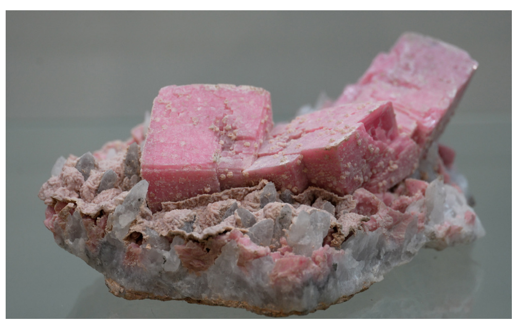
Montana Rhodochrosite from Mineral Museum @ Montana Tech

A Proceedings volume will be published by the MBMG following the 2023 Symposium. Details regarding submission guidelines and dates will be announced at this year's Symposium.